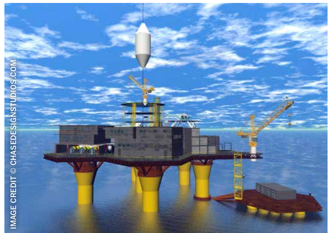
Here, the space elevator tether climber is inside the atmospheric shielding protective box as it leaves the Marine Node.

The research showed that material strength properties would be available in the laboratory between 2015 and 2016. The design of the macro-tether could be tested in the late 2020s. The major hurdle for a successful space